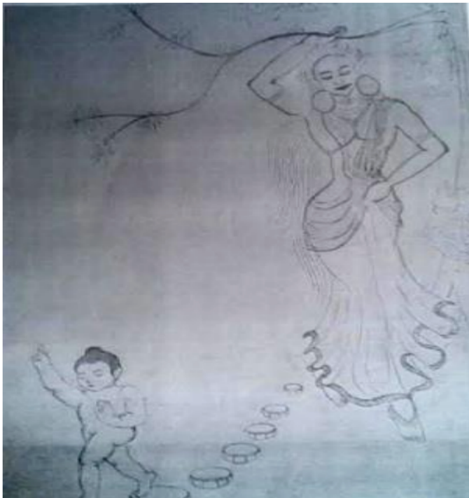
Figure 3: Mother's Image 120 feet and Son's Image of 40 Ft

After the Detailed Project Report is prepared and all required formalities with the line agencies are completed, GR Trust enters into the construction phase. The proposed project activities are hereunder which will be implemented as per the plan prepared.